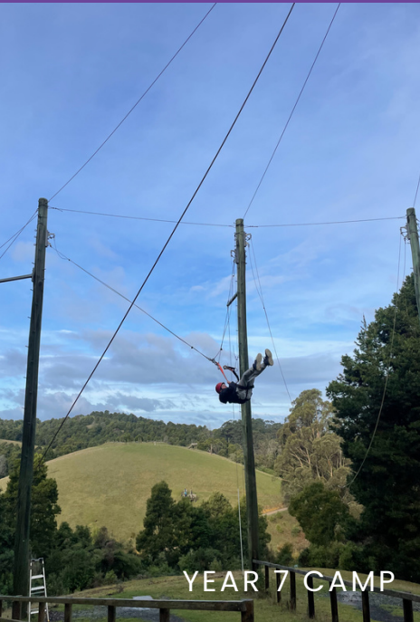
YEAR 7 CAMP